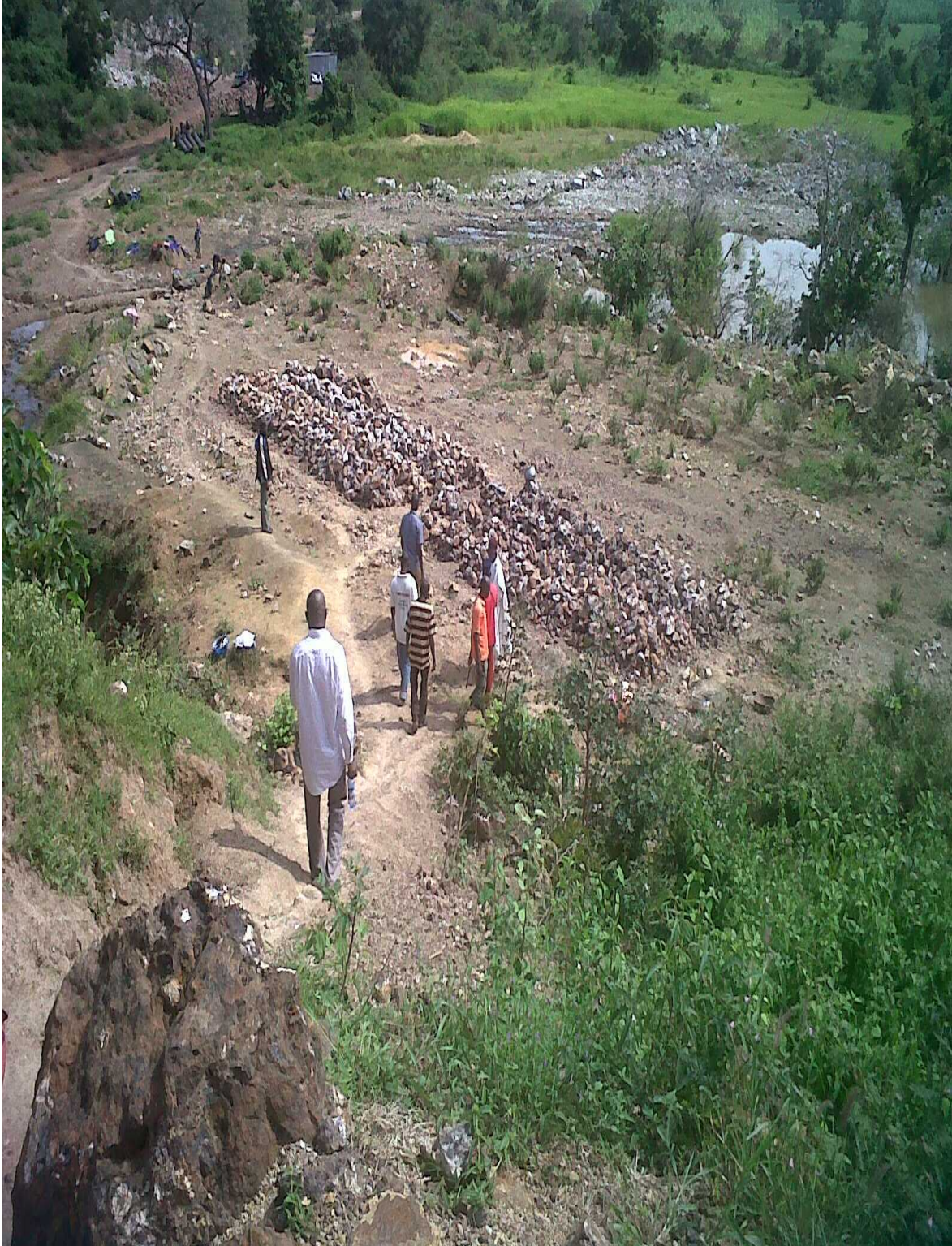
Manganese Ore Operational Site