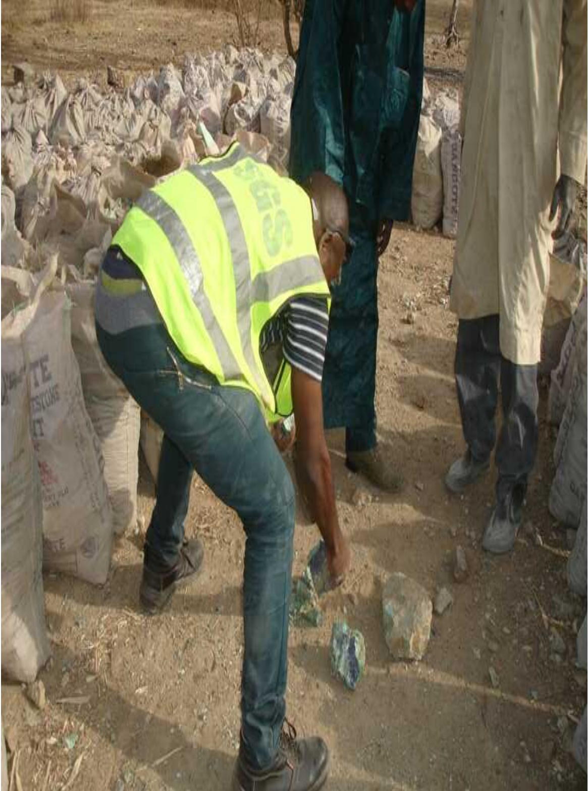
Manganese Ore Operational Site