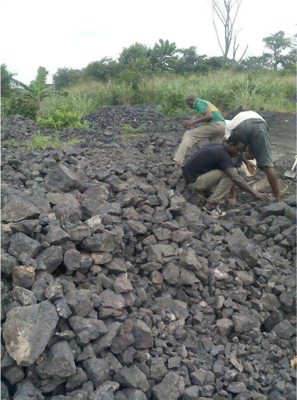
Manganese Ore Operational Site