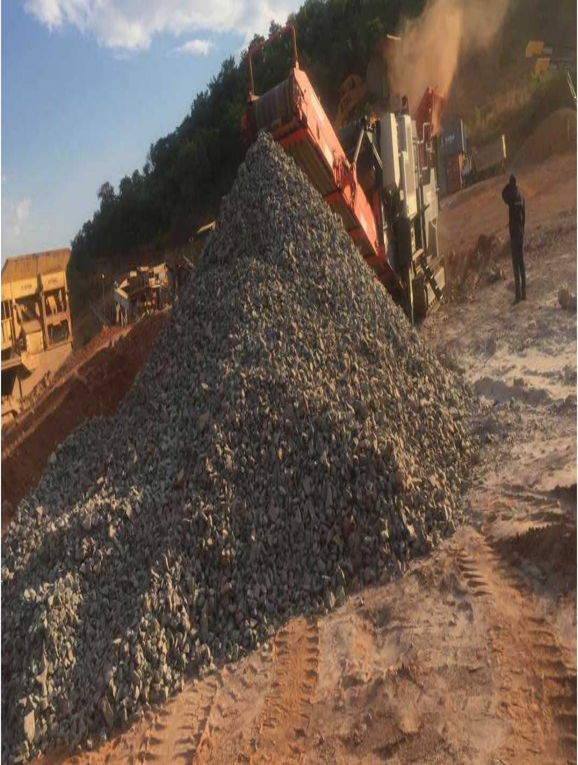
Manganese Ore Operational Site