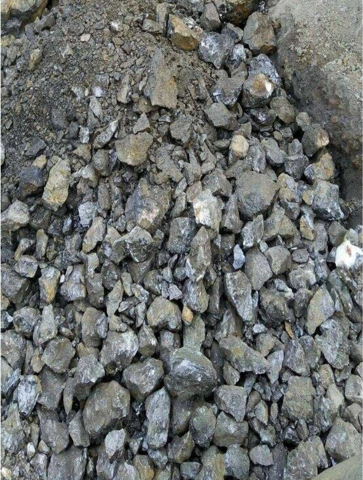
Manganese Ore Operational Site