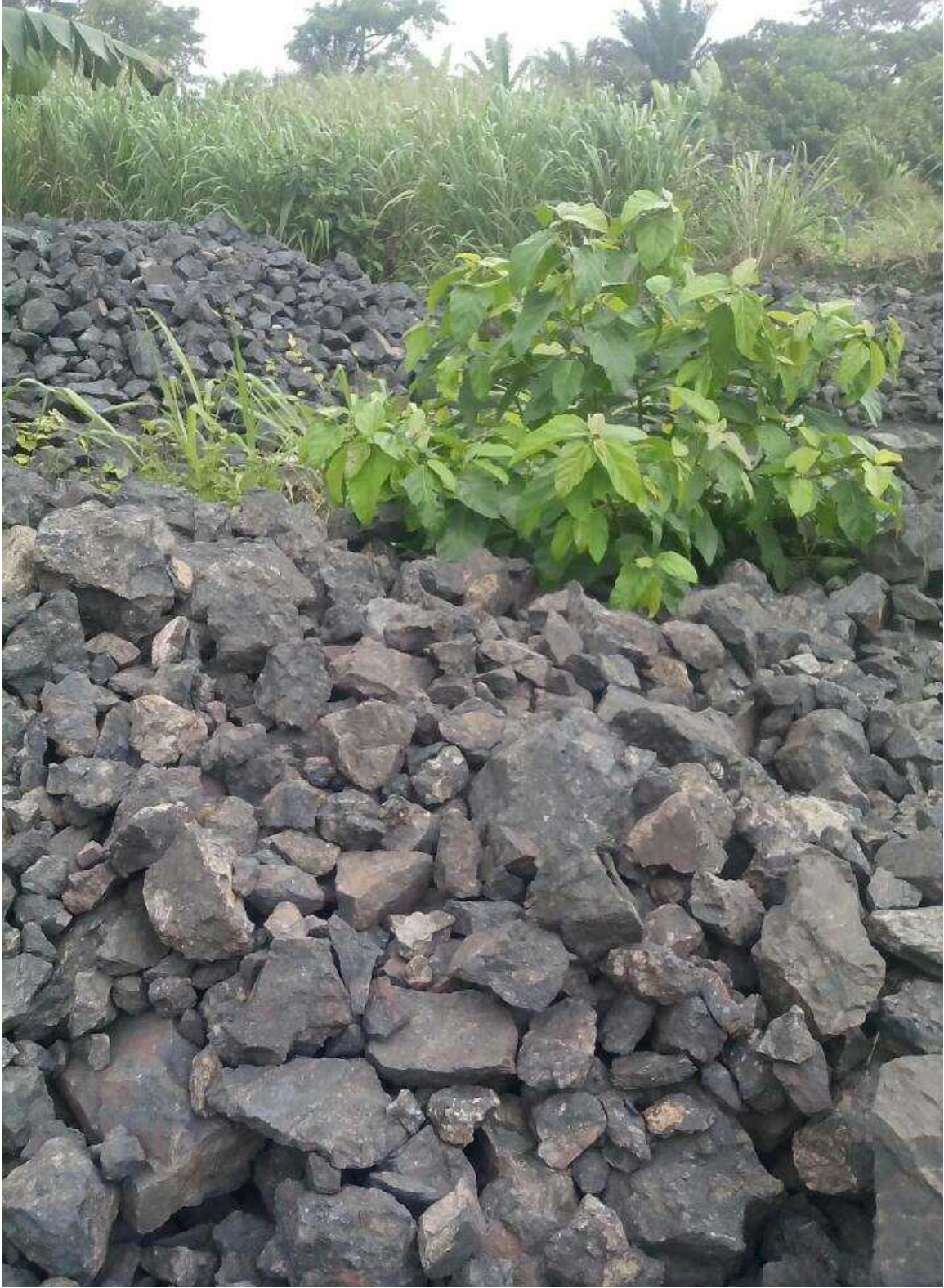
Manganese Ore Operational Site