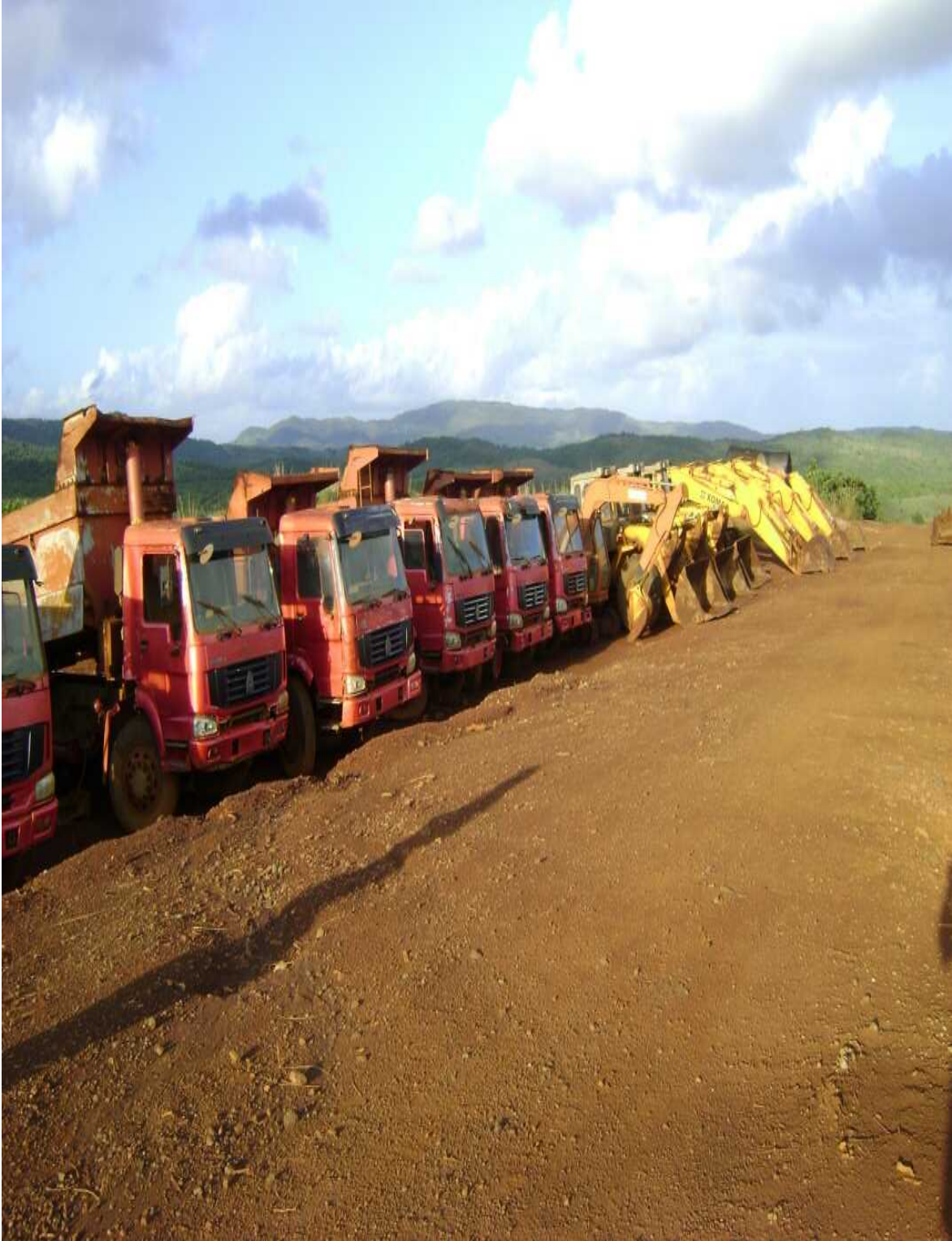
Manganese Ore Operational Site