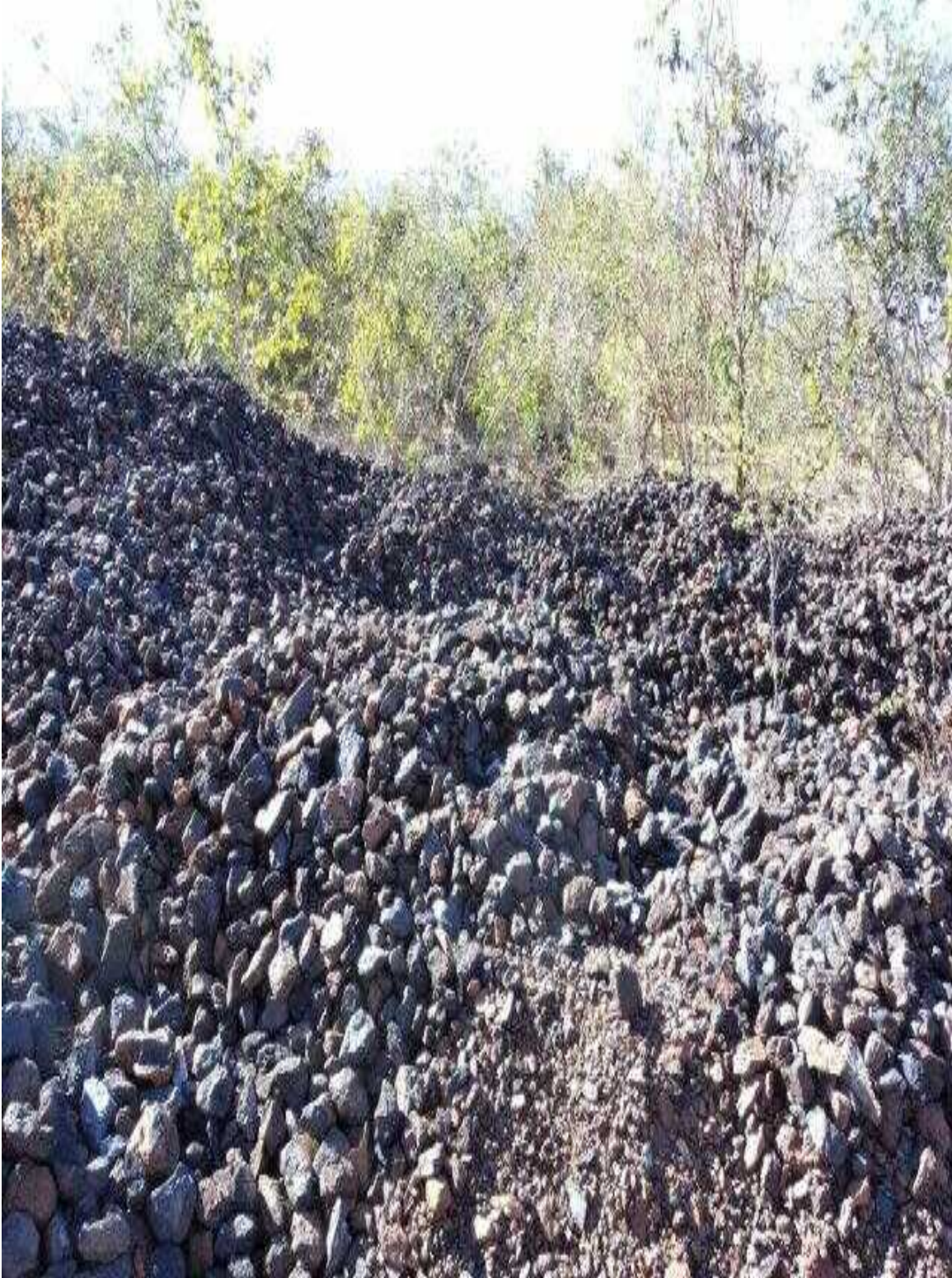
Manganese Ore Operational Site