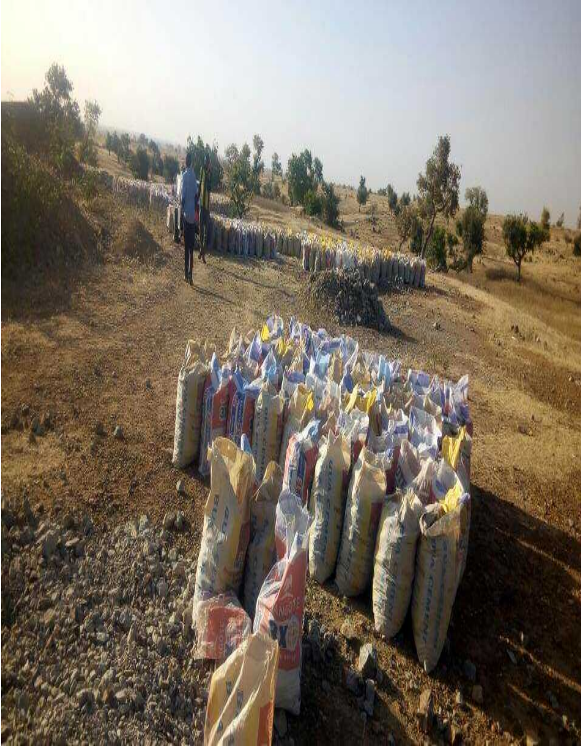
Manganese Ore Operational Site