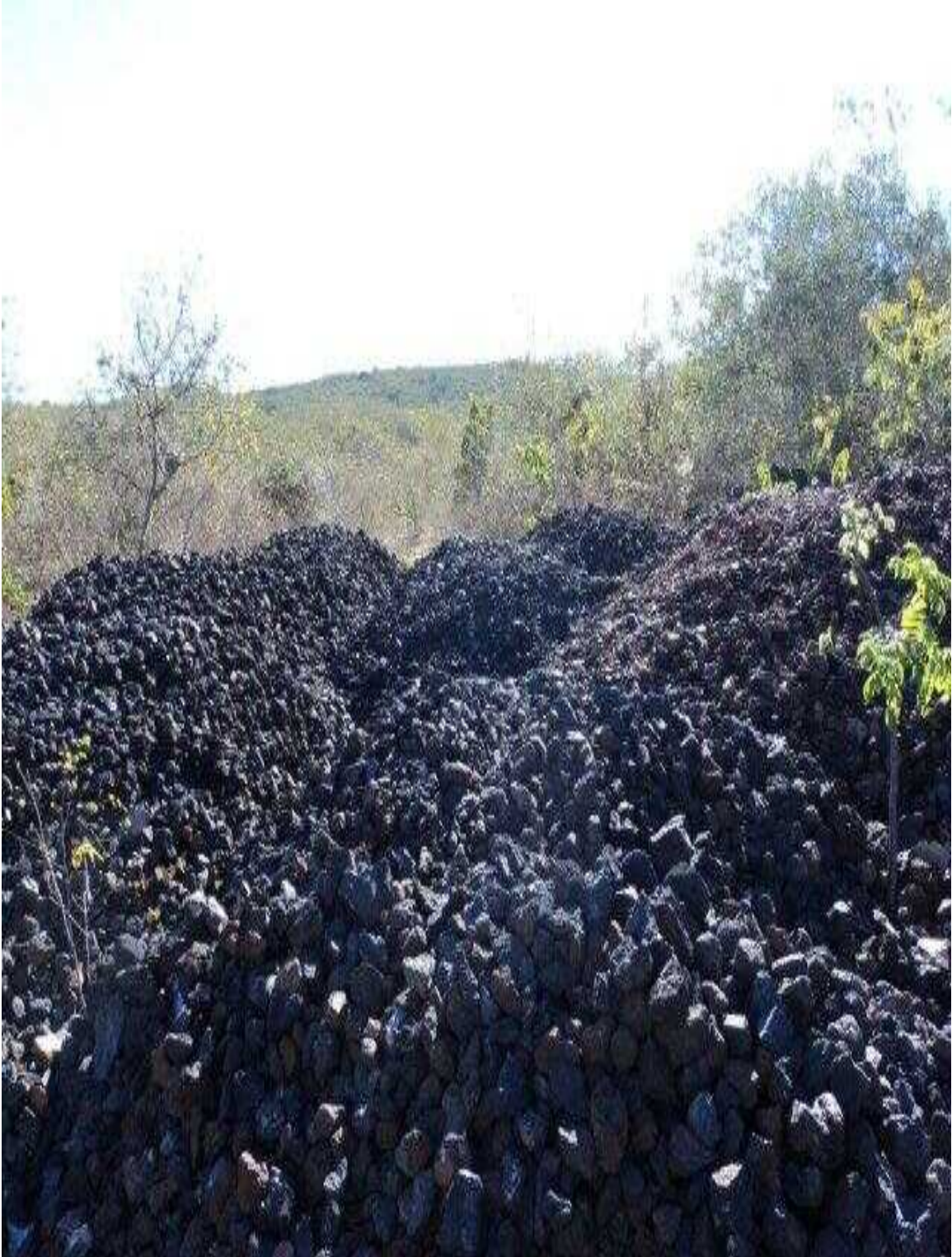
Manganese Ore Operational Site