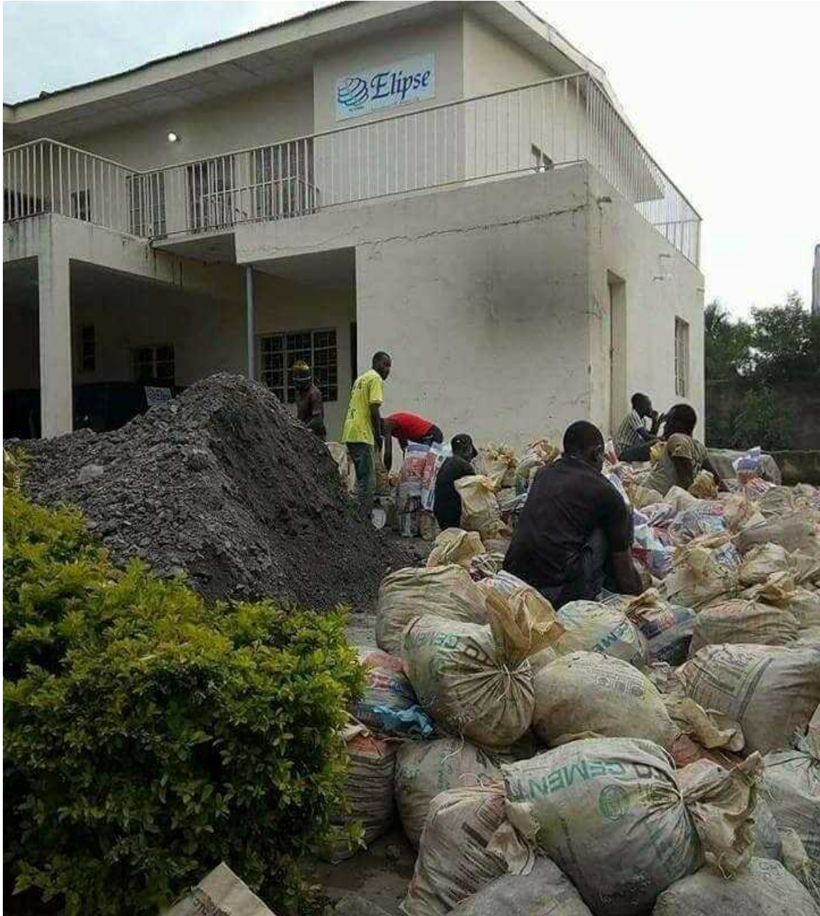
Manganese Ore Operational Site