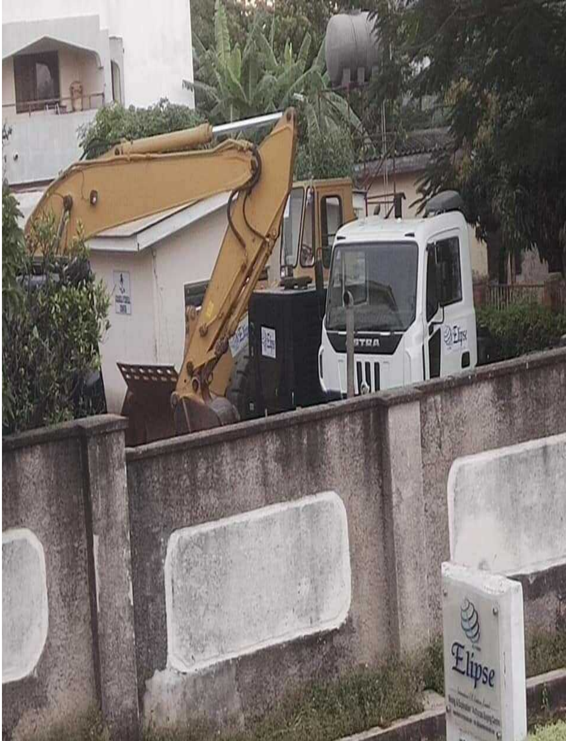
Manganese Ore Operational Site